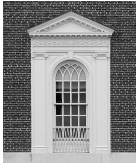
FIGURE 1 Windows are character-defining features in every historic public building. Stone quoins, Ionic pilasters and carved pediments frame multi-light, arched windows defining this Georgian revival facade.

Replacement of historic windows raises preservation and environmental issues requiring more extensive planning, analysis and mitigation to justify the substantial loss of historic materials. Studies exploring historic window replacement need to examine window conditions throughout the building and consider alternatives that preserve as many historic windows as possible. This might entail replacing only irreparably deteriorated windows or consolidating sound windows on principal facades or lower stories most visible to pedestrians.