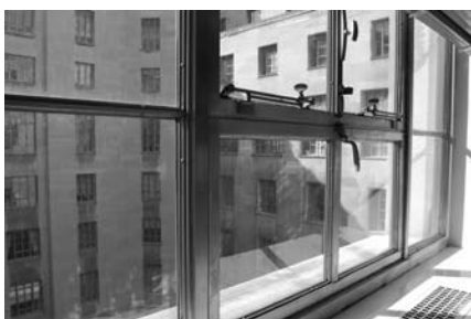
FIGURE 8 Detail views of historic windows retrofitted with laminated glass containing film to resist glass fragmentation and reduce heat gain.

Larger, simpler sash may accept replacement glazing and improve thermal performance without substantially changing the window profiles and detailing. Fanlights and sidelights to exterior historic doors can be similarly retrofitted for improved blast resistance and thermal performance, but as these features are at eye level, the integration of films, new glazing, or panels should be carefully detailed. Overhead skylights and interior lay lights or decorated stained glass should also be reinforced with some measure of protective film or secured glazing to protect persons below.