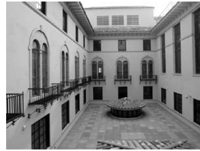
FIGURE 12 Thoughtful analysis to balance GSA preservation, cost, and performance goals supported historic window retention with replacement of non-historic windows at this 1930 courthouse. Blast-resistant, thermal storm windows were installed where original windows remained on courtrooms and the upper and lower levels of the light court.

When analysis strongly supports replacement of window sash or entire window units, consideration must also be given to the feasibility of a combination preservation and replacement approach that retains in place or relocates intact original windows to the building's primary facades or most visible locations (e.g. lower floor levels). As a Section 106 mitigation measure, some GSA projects have preserved sound original windows by consolidating them on the building's lower levels or replacing windows on secondary facades only.