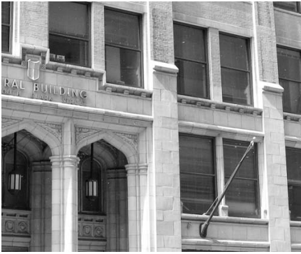
FIGURE 10 Exterior view of blast windows fabricated with custom muntin placing upper and lower panes in separate planes to simulate the appearance of double hung windows.

The slender profiles of some muntins cannot be replicated when blast or insulated glass windows are required. Energy and blast glazing composites are often thicker than single pane glazing, requiring larger muntins and stops to hold the thicker assembly in place. True-divided light (TDL) windows have, in the past, been generally preferred for replicating historic multi-paned windows, but simulated divided light (SDL) sash when properly crafted can produce a convincing effect. SDL use spacers between the panes of the insulated unit, aligned with three-dimensional muntin-grids on the interior and exterior glass surfaces. Keeping the surface grid permanently tight to the surface is critical for effective simulation and can be difficult on very large pieces of glass. SDL offer greater flexibility for matching historic muntin profiles, allowing even narrow muntins to be replicated with insulated units. When replicating any divided light window, specify that replacement windows must match the depth, width and profile of the original window muntins. The addition of insulated glass without the use of a deeper sash will, however, necessitate some compromise in the depth of profiles, and such compromises should generally be made at the interior face.